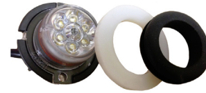
Vertex™ Grommet & Spacer