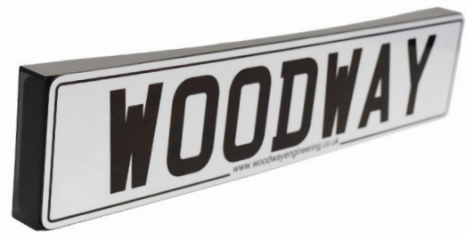
Fend Off Number Plate