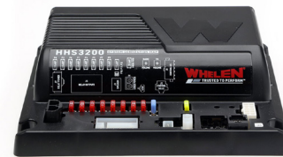
HHS with Uni-Link