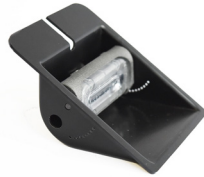
Adjustable Screen Pod and ION™ Mini T-Series